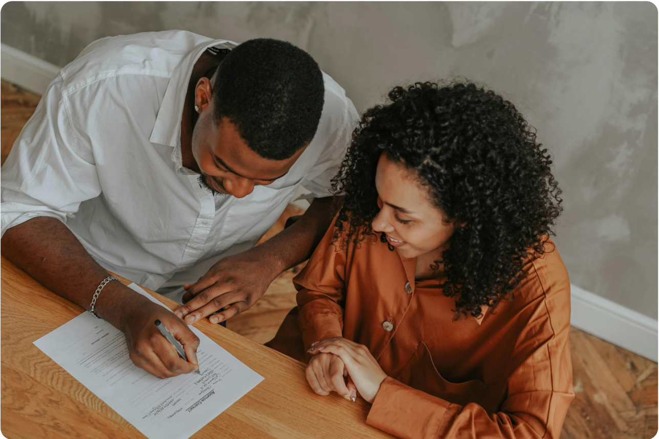
Informed consent process for biohacking practices.