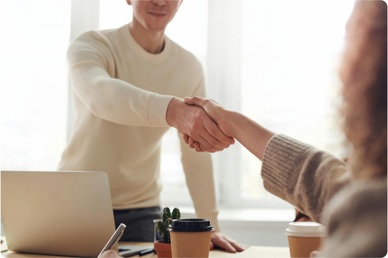
Collaborative approach.

Practitioners should develop clear consent protocols that outline the nature, risks, and expected outcomes of biohacking interventions.