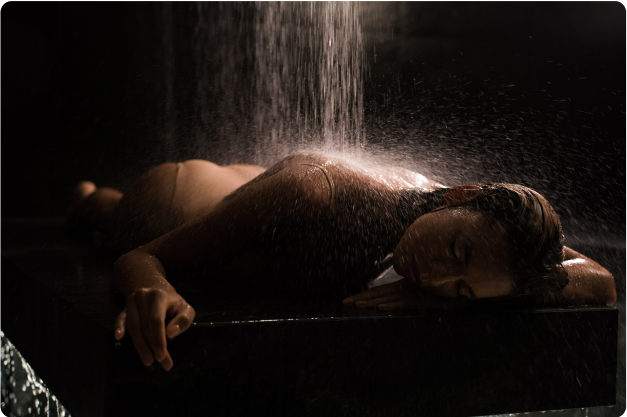
Cold therapy as part of a morning routine.